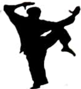
GENERAL SECRETARY, SOUTH ZONE PENCAK SILAT FEDERATION, INDIAN PENCAK SILAT FEDERATION